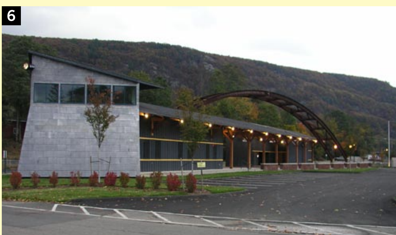
1. Bread and Puppet in downtown Bellows Falls 2. Windham Hotel 3. Opening at Exner Block Gallery 4. Dewitt Godfrey's, Pamplona, metal sculpture 5. Exner Block 6. Connecticut River National Byway Visitors Center

R . A . M . P Rockingham Arts & Museum Project